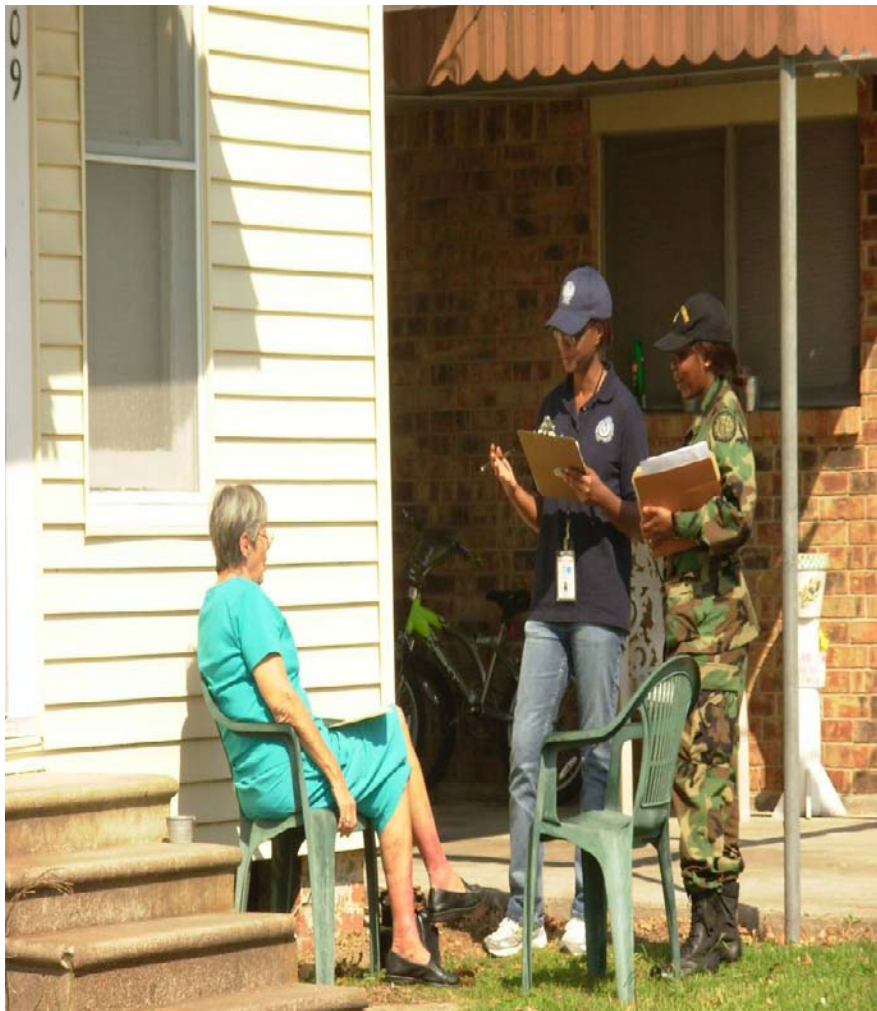
Community Assessment for Public Health Emergency Response Questionnaire, Texas